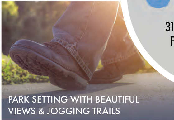
PARK SETTING WITH BEAUTIFUL VIEWS & JOGGING TRAILS