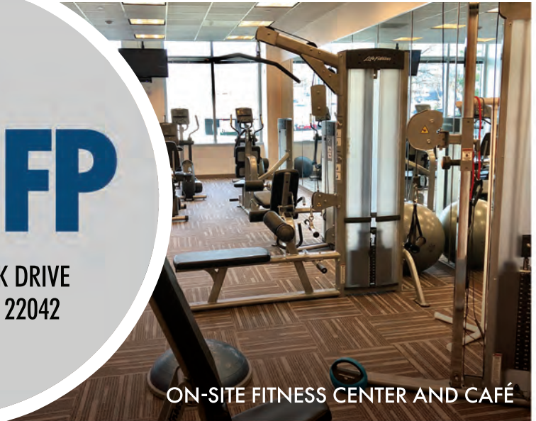
ON-SITE FITNESS CENTER AND CAFÉ