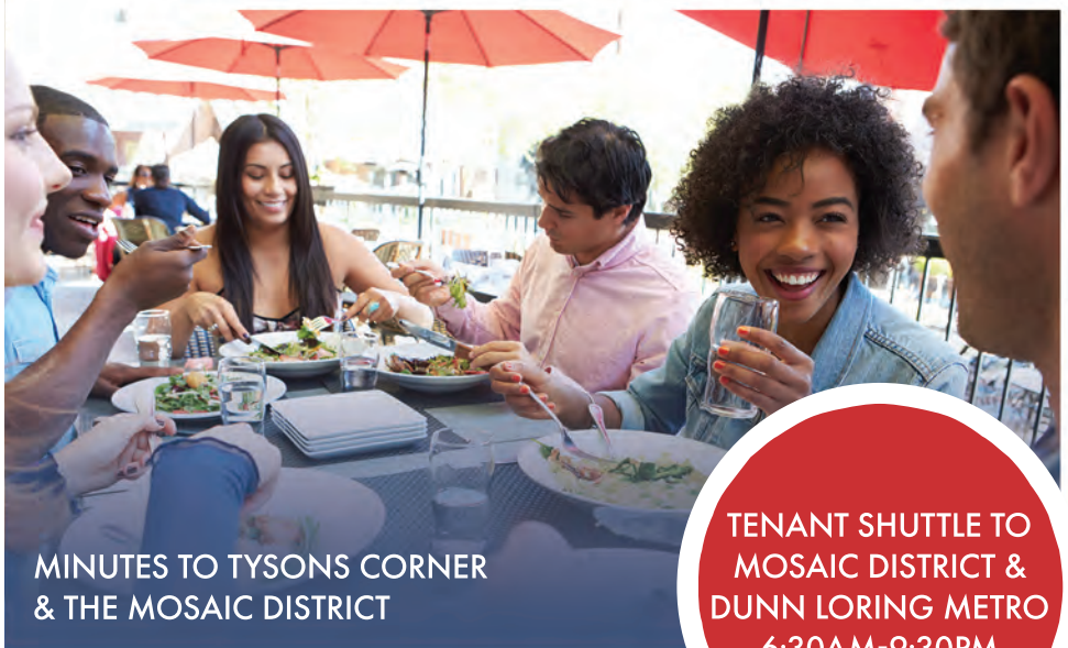
MINUTES TO TYSONS CORNER & THE MOSAIC DISTRICT